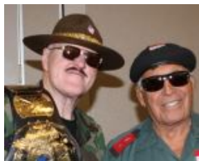
Big Event 18

Since returning to active competition, Jacobs said he has learned that his passion for performing -- one that wasn't fully explored as an active wrestler joining WWE's creative team -- still exists.