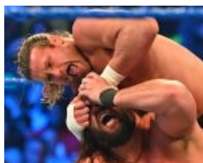
WWE Smackdown Buffalo

"It's good to let that part of myself out again," Jacobs said. "In WWE, I felt like I couldn't be myself a lot of times backstage. But that's on me, [that was the] self-imposed pressure of feeling that I need to conform."