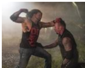
WrestleMania 36: Night 1

COMING SOON: Slamwrestling.net THE SCOOP: Visit our News & Rumours page .