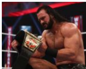
WrestleMania 36: Night 2