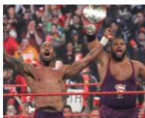
WWE Raw Brooklyn